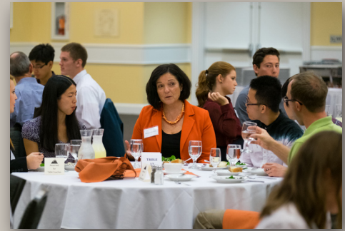
Students interacting with Keynote Speaker at the Summit 2015 event.