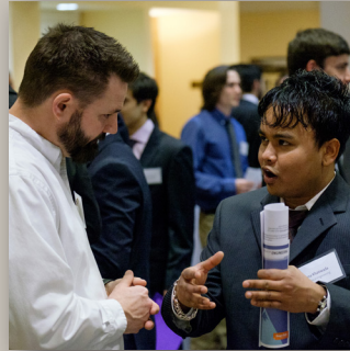
Student networking with an industry professional during Suit Camp 2016.