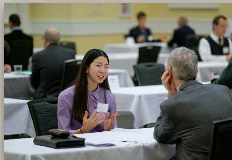
Leadership Academy members conducting mock-interviews with professionals during Suit Camp 2016.